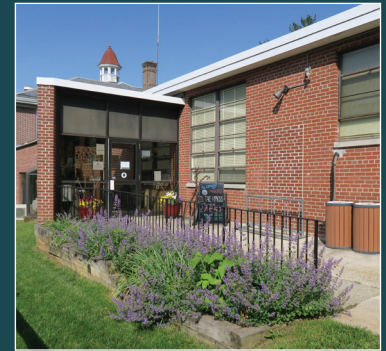
Peapack & Gladstone branch Municipal Complex, School Street Peapack, NJ 07977 (908) 458-8440