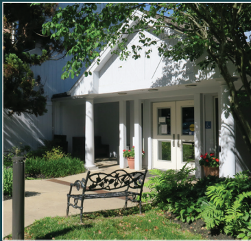
Mary Jacobs branch 64 Washington Street Rocky Hill, NJ 08553 (908) 458-8480