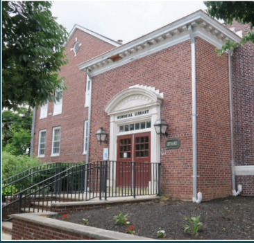
Bound Brook branch 402 East High Street Bound Brook, NJ 08805 (908) 458-8410