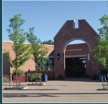
Hillsborough branch 379 South Branch Road Hillsborough, NJ 08844 (908) 458-8420