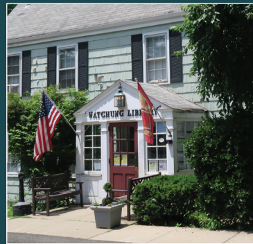
Watchung branch 12 Stirling Road Watchung, NJ 07069 (908) 458-8455