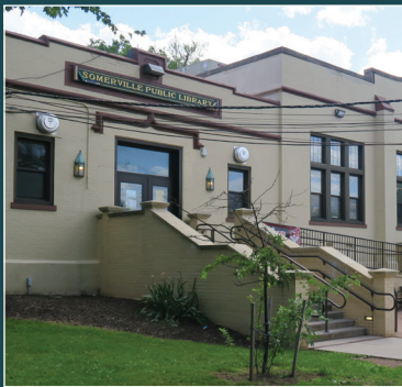
Somerville branch 35 West End Avenue Somerville, NJ 08876 (908) 458-8445