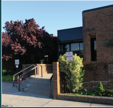
Bridgewater branch 1 Vogt Drive Bridgewater, NJ 08807 (908) 458-8415