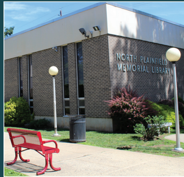
North Plainfield branch 6 Rockview Avenue No. Plainfield, NJ 07060 (908) 458-8435