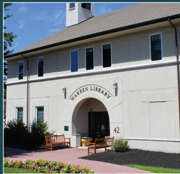
Warren Township branch 42 Mountain Boulevard Warren, NJ 07059 (908) 458-8450