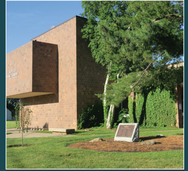
Manville branch 100 South 10th Avenue Manville, NJ 08835 (908) 458-8425